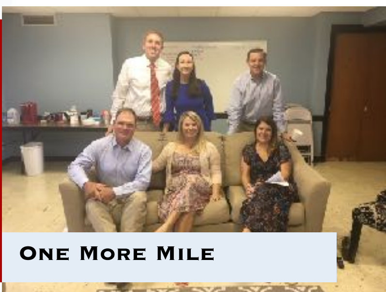
ONE MORE MILE