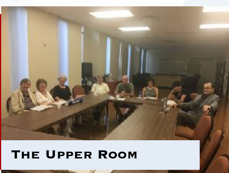
THE UPPER ROOM