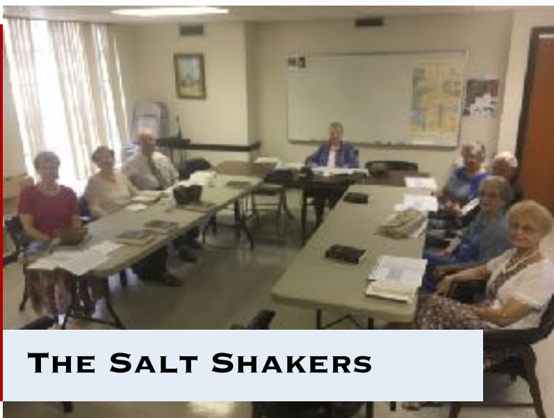
THE SALT SHAKERS