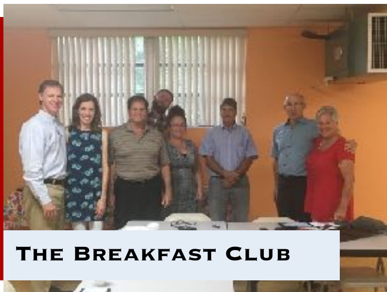
THE BREAKFAST CLUB