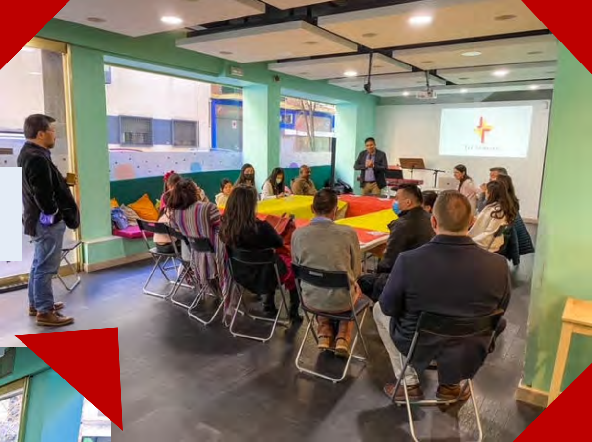
Sunday school class after our worship service.