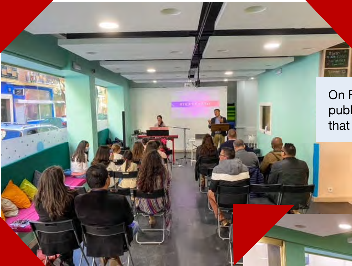
On February 13 th we celebrated our first public worship service in the new building that God provided.