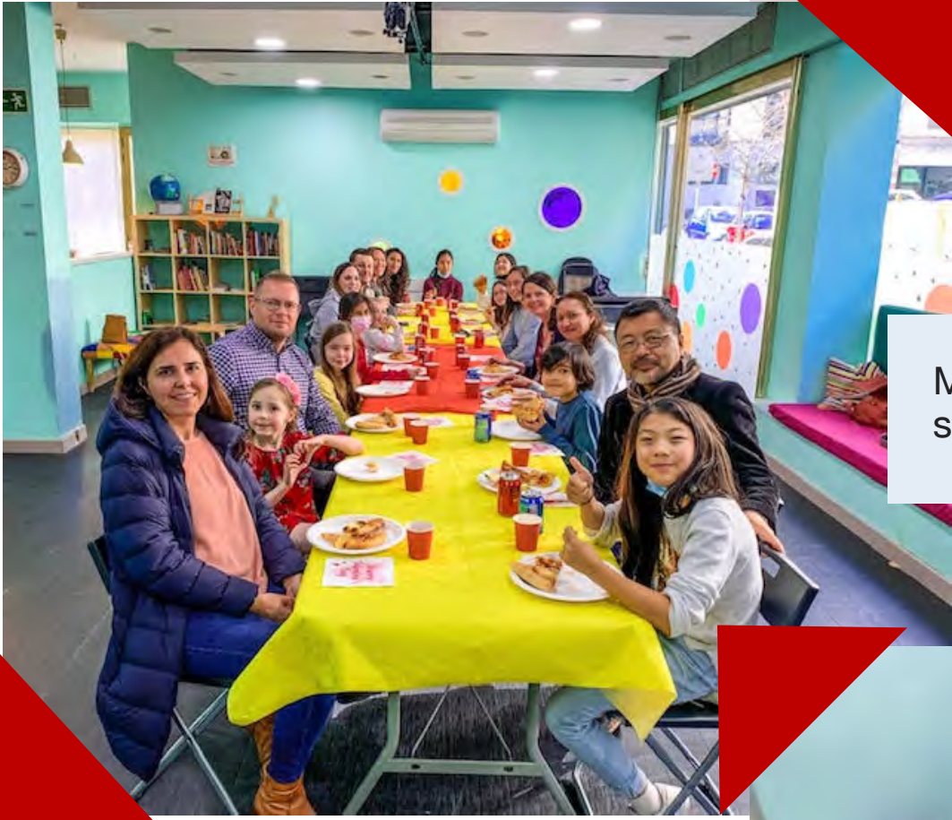
Meal with our church family after our worship service and Sunday school classes